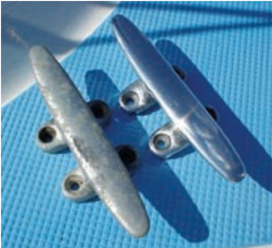
Aluminum deck cleats clean up nicely with a little judicious sanding, brushing and buffing, left and right. Stainless-steel gudgeons, below, also respond to TLC and will enhance the boat's appearance when re-installed.