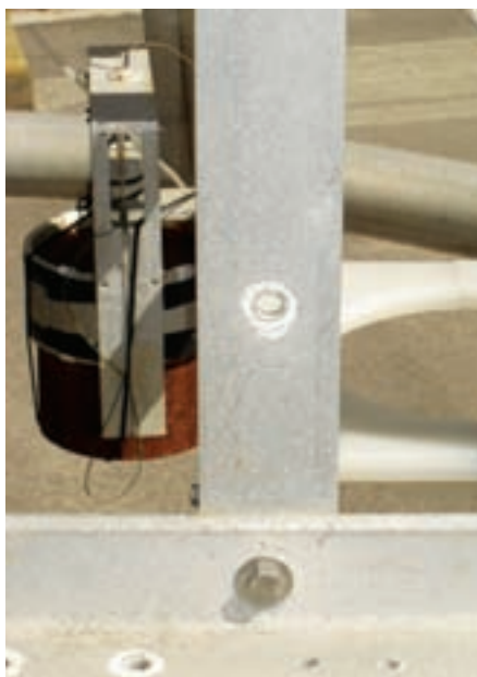
Aluminum corrodes when it's in direct contact with stainless-steel fasteners.

will usually tell you what to use for a specific project. I keep several different compounds on hand as I am likely to be working on different metals at any given time. I also have different wheels for each type of metal, which is the best way to avoid cross-contamination.